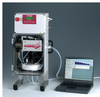
For online condition monitoring, the PAMAS WaterViewer can be fixed at the wall. Equipped with an aluminium mounting rack, it can also be used for on-site measurements.