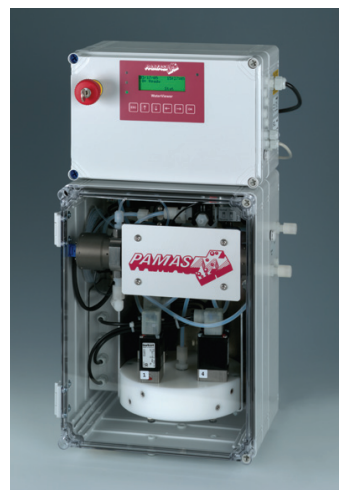
Equipped with a Multiplexer Unit, the PAMAS WaterViewer can analyse up to 32 different waterlines.