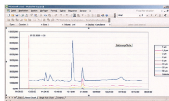
The software shows measuring reports in tables and graphs. This makes events and trends of particle numbers over size easily visible.